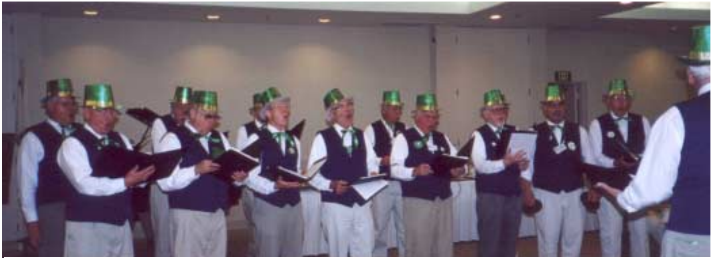
The SongSirs entertain the members at the March Luncheon