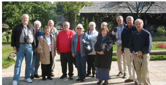
Village Museum-Bucharest, Romania