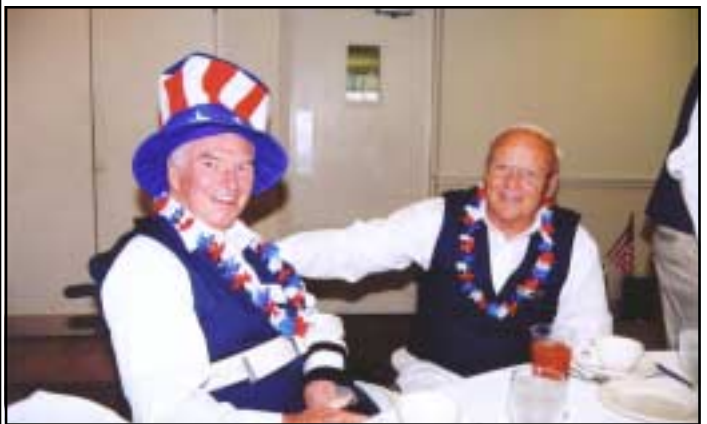
Two Real Yankee Doodle Dandies