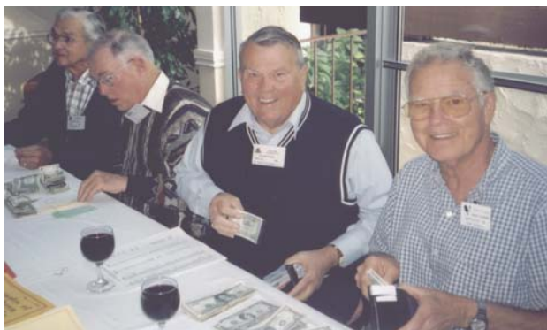
Recounting: Are these guys from Florida?