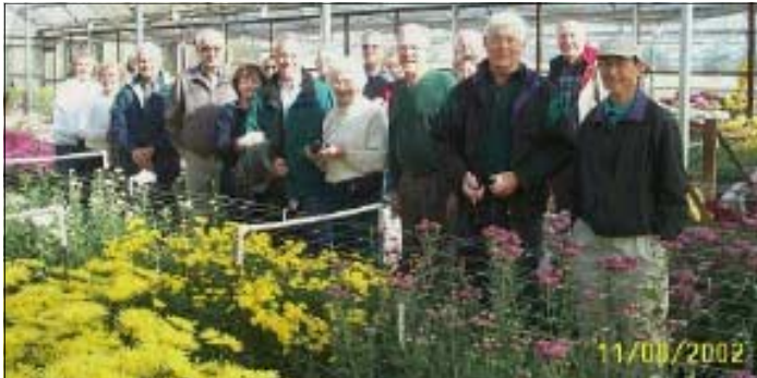
The Garden Club touring King's 'Mums