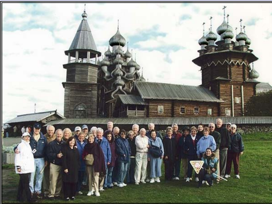
GROUP PHOTO TAKEN AT ONE OF MANY PICTURESQUE PLACES IN RUSSIA. Do you recognize anyone?

Time Value Mail Please deliver as soon as possible.