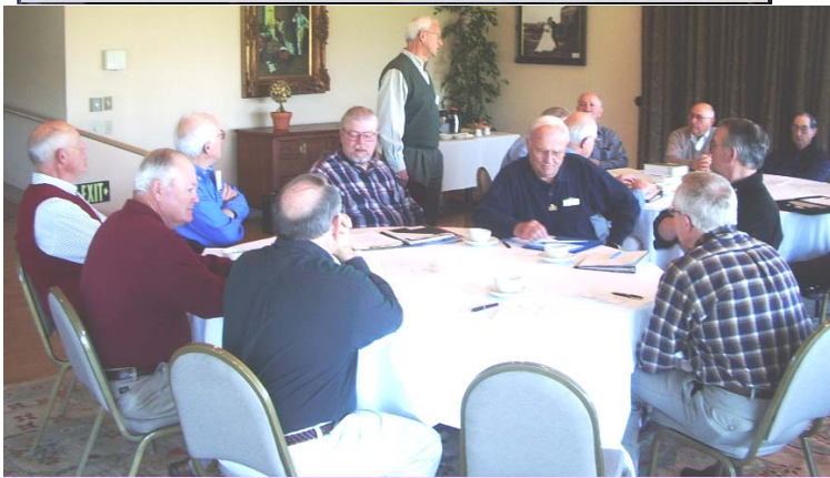
February 2005 Executive Board Meeting