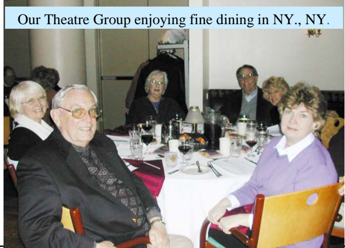
Our Theatre Group enjoying fine dining in NY., NY.