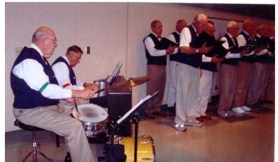
Song Stars at the Walnut Creek Presbyterian Church VIP luncheon on February 1st