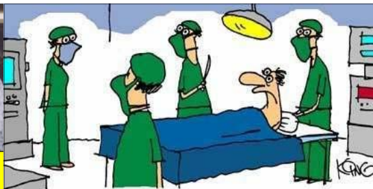
"Nurse, get on the internet, go to SURGERY.COM , scroll down and click on the 'Are you totally lost?' icon."